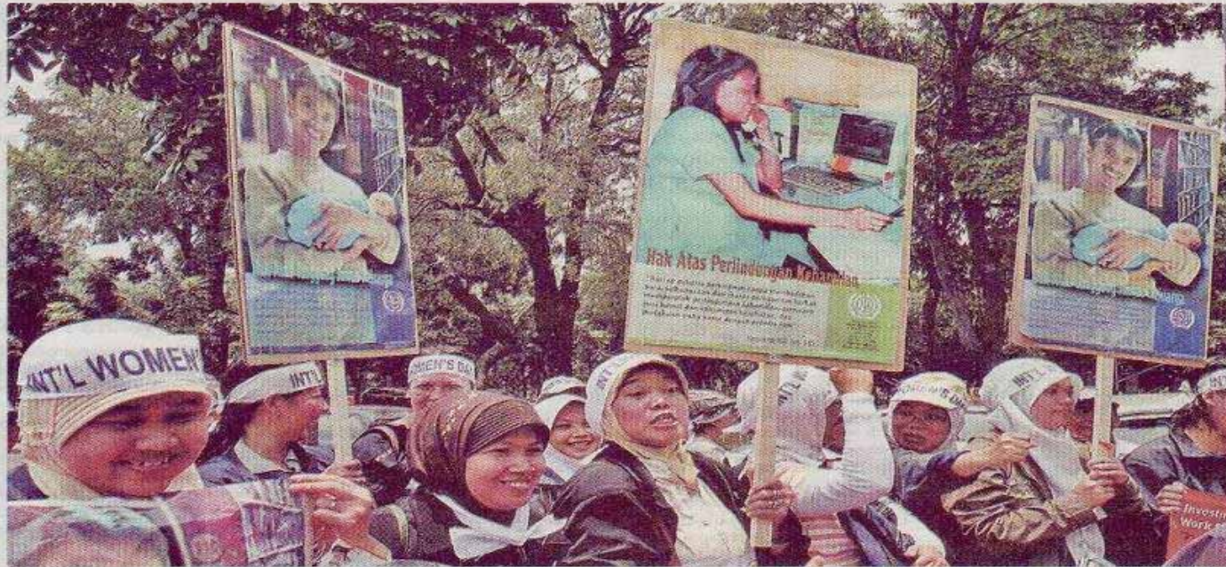
LINDUNGI PEREMPUAN: Ratusan perempuan beraksi damai dalam peringatan Hari Perempuan Internasional, di Jakarta, kemarin. Mereka menyerukan kepada masyarakat untuk melindungi perempuan dari tindak kekerasan dan intimidasi.

MEDIA INDONESIA • KAMIS, 13 MARET 2008 • HALAMAN 8